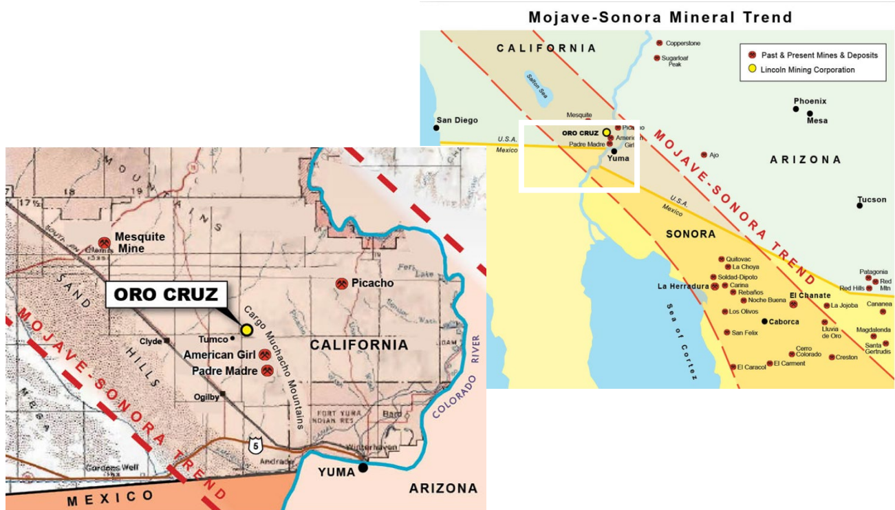
Oro Cruz Gold Resources – September 2010 – Tetra Tech Report

In September 2010, Lincoln filed a NI 43-101 technical report. Oro Cruz has an Inferred resource estimate of 376,600 ozs gold, grading 0.050 opt gold at a 0.01 opt cutoff grade. The existing pit and underground decline expose gold mineralization. Previous work has identified multiple exploration targets and Lincoln has identified several satellite gold zones, which offer potential for increasing gold resources.