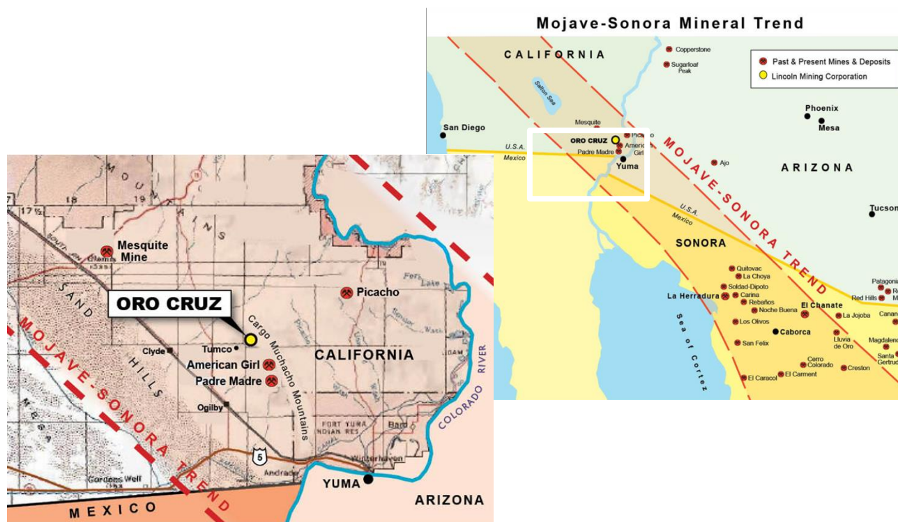
Oro Cruz Gold Resources – September 2010 – Tetra Tech Report