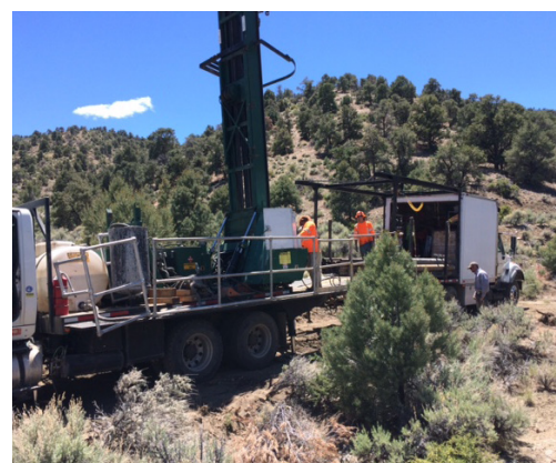
Above - Top: Pan & soil testing at Pine Grove; Centre: Geologic team at work Bottom: Sonic drill at work on Wilson deposit

Lincoln Gold Mining Inc. #400 - 789 West Pender Street Vancouver, BC V6C 1H2 Canada